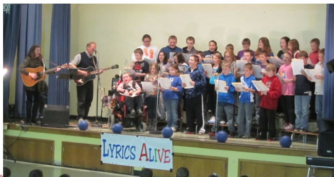
Fourth and fifth grade students at Johnson Elementary School presented a concert recently to showcase songs through Lyrics Alive, a creative writing, music and enrichment program. Lyrics Alive, a nonprofit organization, received a $1,218 grant from the Scott County Community Foundation, along with support from the Community Arts Program at Hanover College; the Indiana Arts Commission, a state agency; and the National Endowment for the Arts, a federal agency.