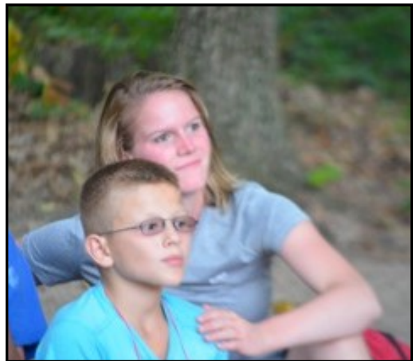
A camper and counselor at Englishton Park's summer program enjoy activities. Englishton Park received funds during our Community Grants Program to assist with the camp expenses.