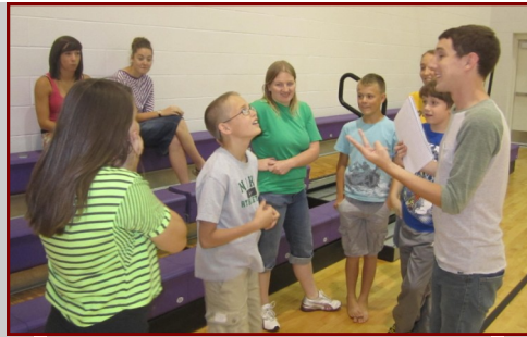
Students are quizzed on their knowledge of survival skills and Hunger Games trivia at the Edge summer program at Scottsburg Middle School.

school services to children of Lexington Township