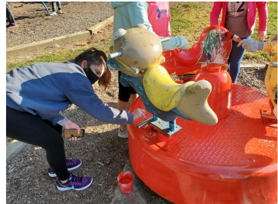
YGC members spent a Saturday morning painting playground equipment, staining benches and edging, and mulching at Lake Lola.